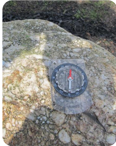
The Grundy Stone is orientated perfectly-North.

North is specifically treated as the fundamental direction: