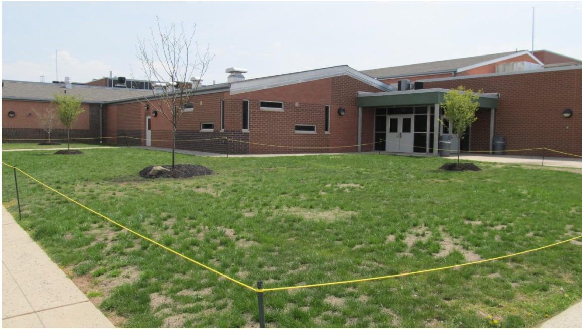
April 15 th , 2012